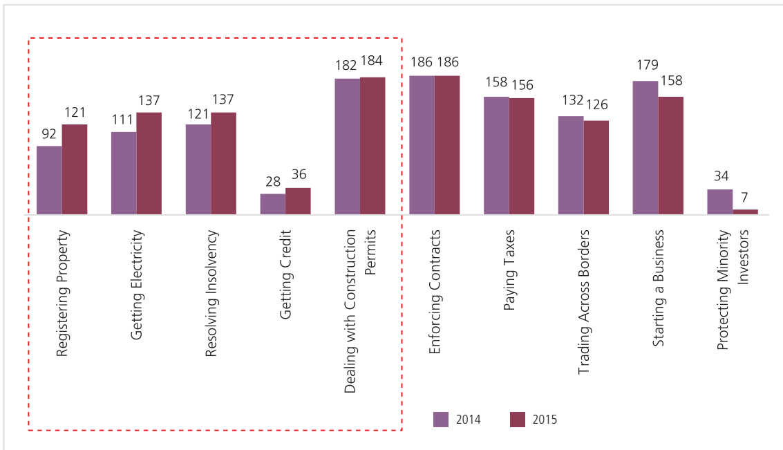
India's Ranking on Sub-indices in 2014 & 2015